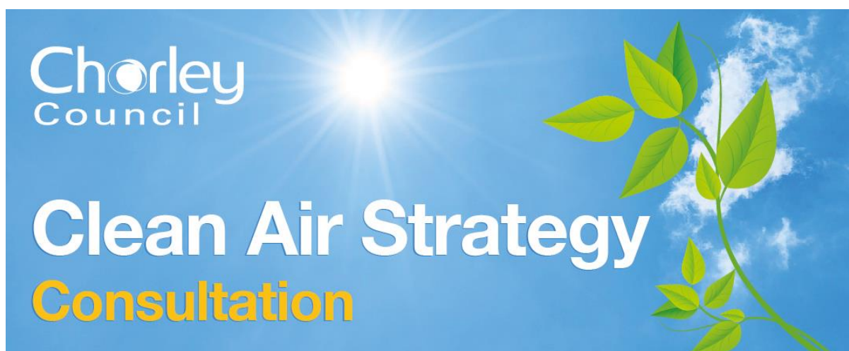
FIGURE 4: CLEAN AIR STRATEGY BANNER