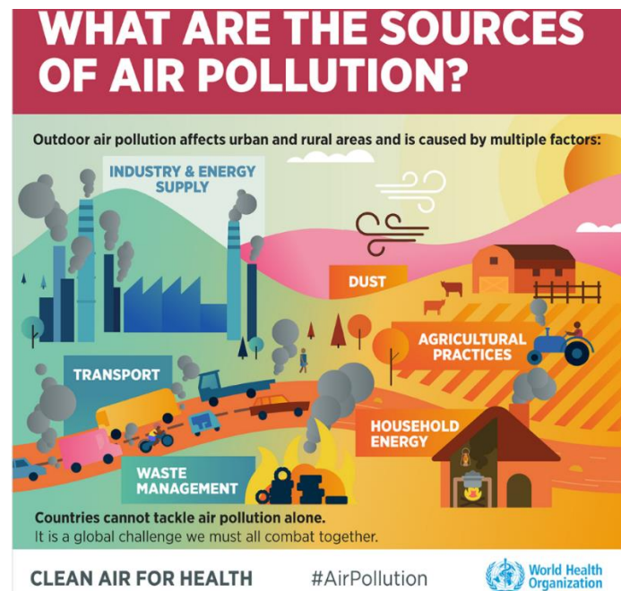
FIGURE 2: WHAT ARE THE SOURCES OF AIR POLLUTION? INFOGRAPHIC FROM THE WORLD HEALTH ORGANISATION